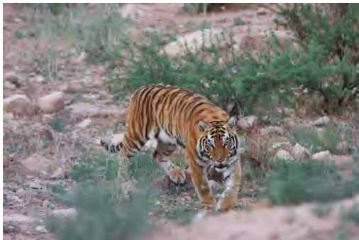
PJ: Bengal Tiger 8/09/2006