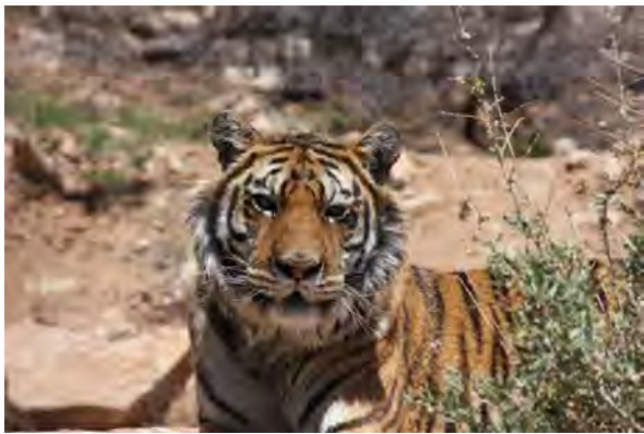
Rocky: Bengal Tiger 8/15/1997