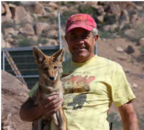
JONATHAN & JACOB

Our new coyotes, Roxy and Jacob were introduced to Riley! The introduction was an absolute success and they are all doing well. We are so happy that they can share their lives with each other in a large habitat.