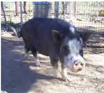
Stanley: Pot-bellied Pig 8/13/1998