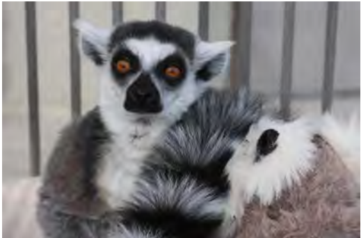
Precious: Ring-tailed Lemur 8/2004