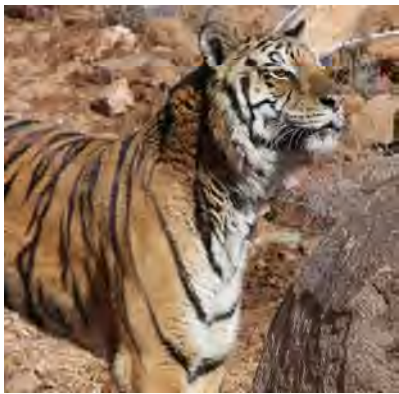
Max: Bengal Tiger 8/15/1997