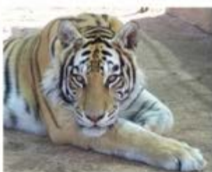
Sasha: Bengal Tiger 3/17/2003