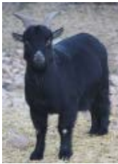
Snap- Pygmy Goat Acquired on 1/15/2010