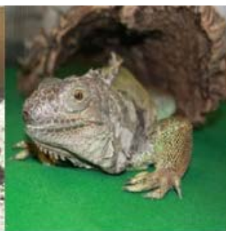
Elmo Green Iguana 1/11/1996