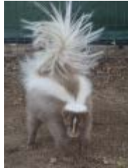
Smellvin Champagne Skunk DOB: 2/20/2008