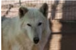
Moondance Hybrid Wolf DOB: 2/5/1997