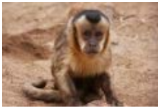
Max-Brown Capuchin 1/1/2004