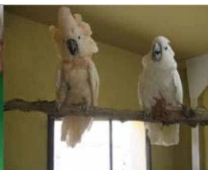
Willie & Zeus - Cockatoo Moluccan & Umbrella 1/1/1998