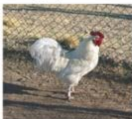
Slippers: Rooster 3/15/2004