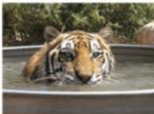
Skylar: Bengal Tiger 3/17/2003