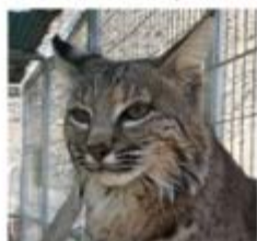
Chloe: Bobcat 3/10/2010