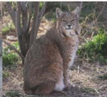
Tara Bobcat 4/28/1994