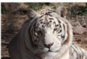
Sebastian: Bengal Tiger 3/17/2003