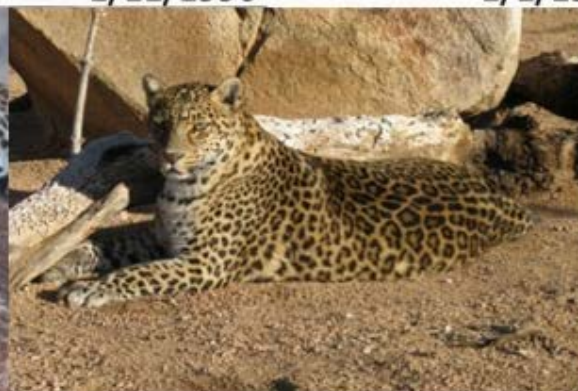
Akasha - Spotted Leopard 1/4/1993