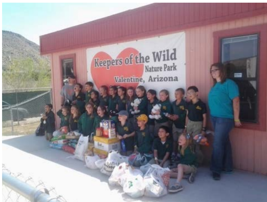
Young Scholars Academy Field Trip to Keepers of the Wild

On April 16th , two 3rd grade classes (approx. 50 children) from Young Scholars Academy took a field trip to Keepers of the Wild.