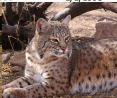
Angel - Bob Cat 1/29/2002