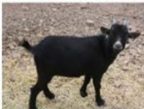
Heidi: Pygmy Goat 3/12/2010