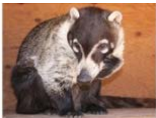
Rocky: Coatimundi 3/2004