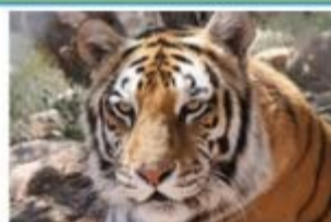
Grace: Bengal Tiger 3/19/2003

Again, thank you- we are so grateful to all of you!