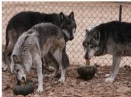
Pawnee, Tewa & Montana Grey Wolves 4/20/1999