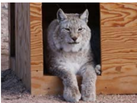
Kitty Eurasian/Siberian Lynx 4/11/1997