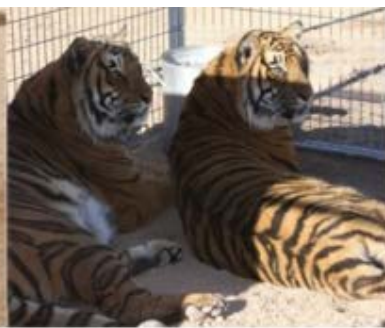
William & Victor Bengal Tigers 4/22/2006