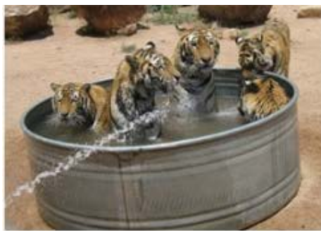
Malachi, Moses, Marilyn & Millie Bengal Tigers 4/8/2006