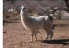
Snickers Llama Acquired: 2/5/2011