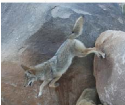
Riley Coyote 4/18/2011