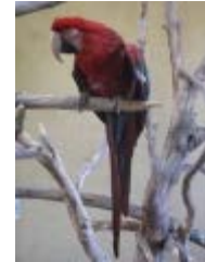
Archie Green Winged Macaw DOB: 2/16/1993

13441 E. Highway 66 | Valentine, AZ 86437 US