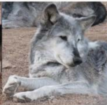
Colorado Grey Wolf 4/20/1999