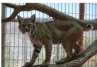
Zoe: Bobcat 3/2008