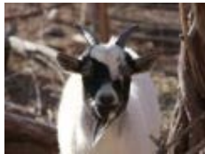
Pop- Pygmy Goat Acquired on 1/15/2010

13441 E. Highway 66 | Valentine, AZ 86437 US