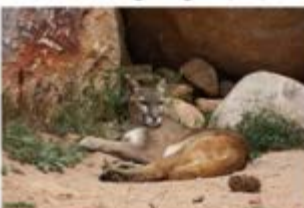
BamBam: Cougar 3/1/1994