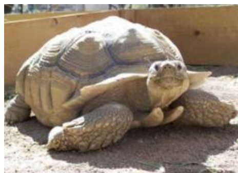
Bob African Spurred Tortoise 1/13/1997