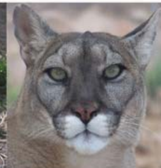
Baby Cougar 4/18/1995