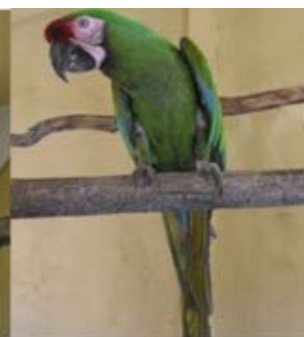
Bryce Military Macaw 1/1/1998