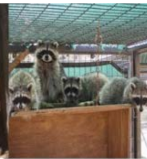
Scooter & Tess 4/2008 Randy & Chevy 4/2010 Raccoons