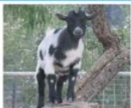
Greta: Pygmy Goats 3/29/2010