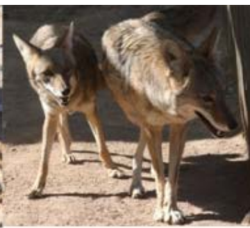
Jack & Jill Coyotes 4/2007 & 4/2009