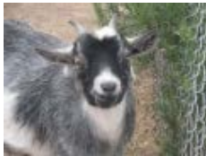
Crackle- Pygmy Goat Acquired on 1/15/2010